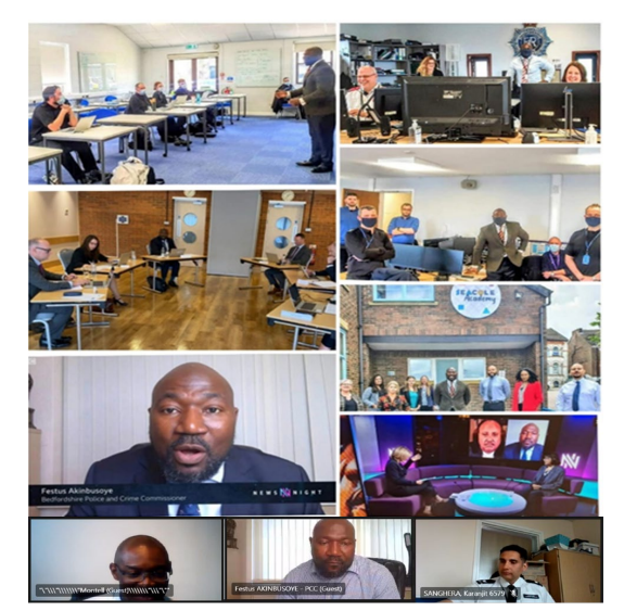
Stop and Search Scrutiny Panel

I had great conversations with the Chief Executive Officers at Luton Borough Council and Central Bedfordshire Council to report back on what we're doing to keep residents safe as well as the Mayor of Bedford. My pledge to crush vehicles used for fly-tipping will be happening over the summer months, and my pledge to address the drug and alcohol related causes of crime in our county is also underway with a new trial to support people with drug and alcohol support as part of a conditional caution.