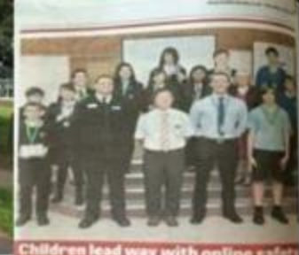
Children lead way with online safety

Bedfordshire Police has been working with a group of children from Barnold Academy to create a digital safety video. The children, who are members of the school's digital safety team, have been trained by police officers on how to create a video that raises awareness of online safety. The video, which is now available on the school's website, features the children talking about the dangers of online safety and how to stay safe. The children were given the opportunity to ask the police officers any questions they had about online safety. The police officers were impressed with the children's work and the message they have delivered.