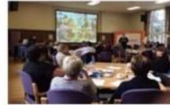
Bedfordshire Police We'll be holding a Twitter Q&A about #onlineCSE #onlinegrooming with @YouthSafePolice on Tuesday at 7pm